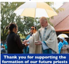
Thank you for supporting the formation of our future priests